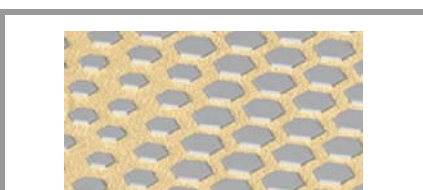
inhomog. honeycomb structure